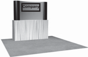
TABLE TOP UNIT

Rental Units Include: Draped Table (Select color below) Classic Carpet 10' X 10' (Select colour below) Installation & Dismantle of Exhibit Material Handling of Exhibit Nightly Vacuuming 1-200 Watt Halogen Light (Electrical service & labour not included) Purchase Units Include: 1-Case One Time Installation & Dismantle